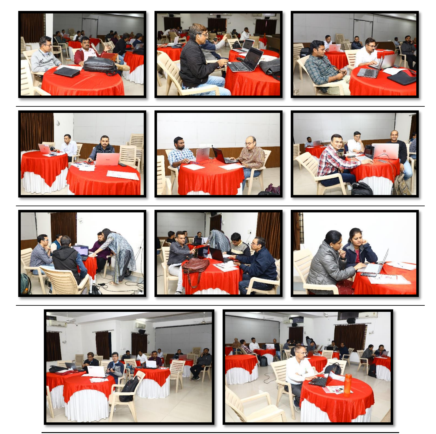
In the Practice session, One-page sample translation was done by the translators of the allotted course material.